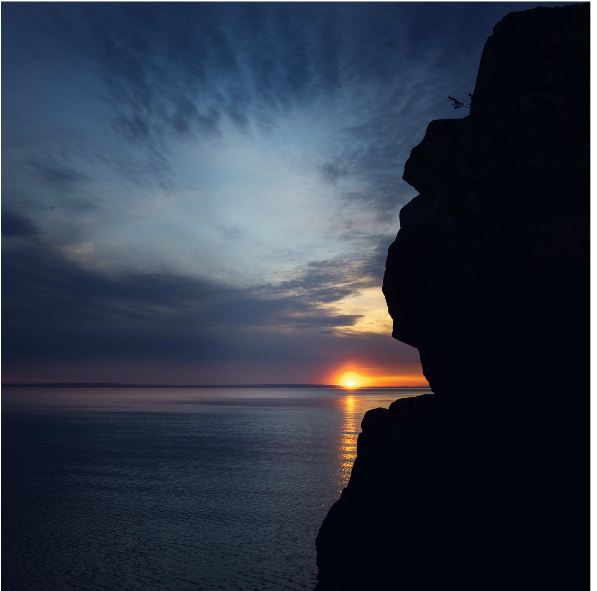
Lake Vättern, Sweden Ugly Vättern man eating sunset