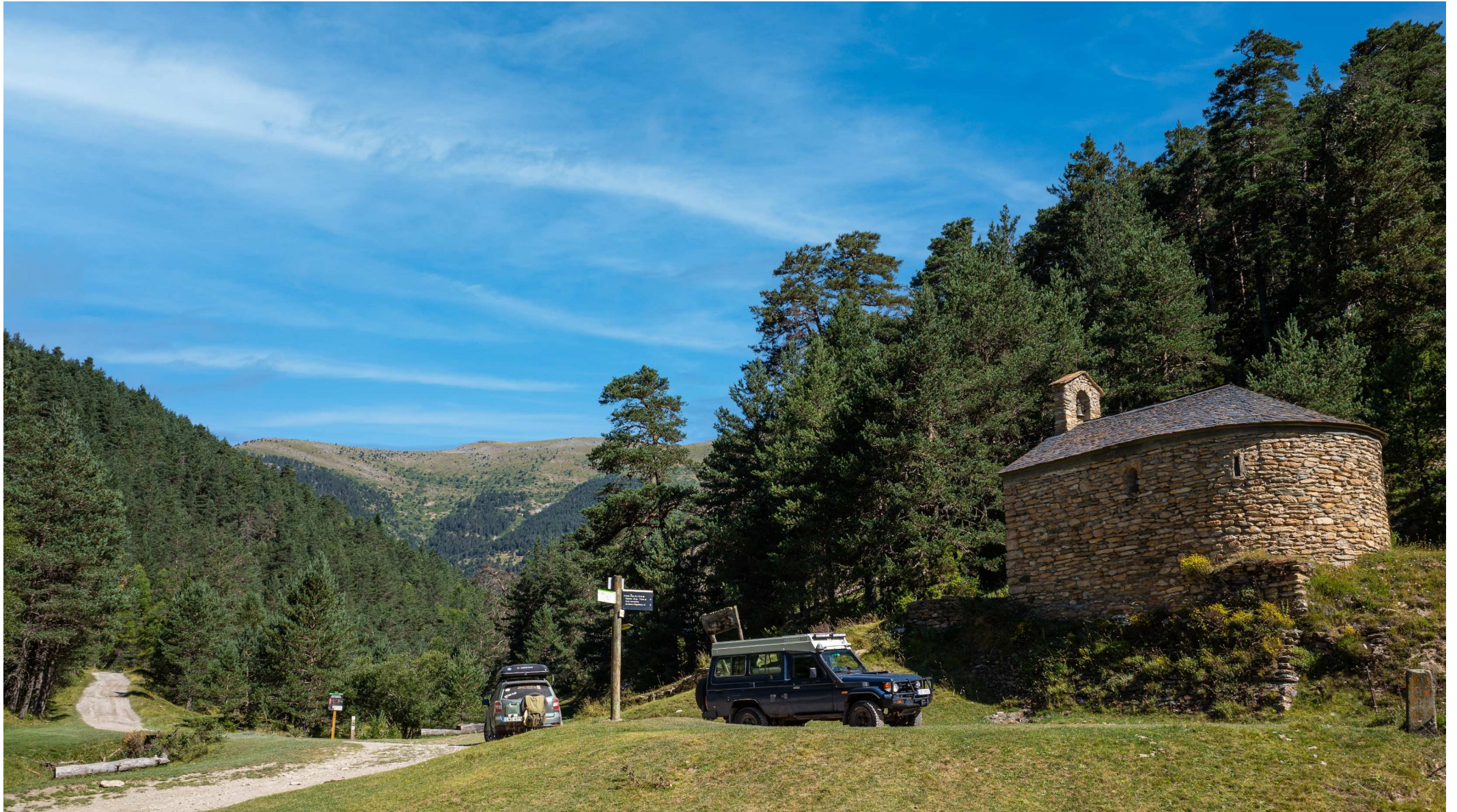
Ermita de Santa Magdalena, Catalan. In the Pyrenees at 1550 m altitude. A small chapel, but also a shelter for travelers, built in 1712