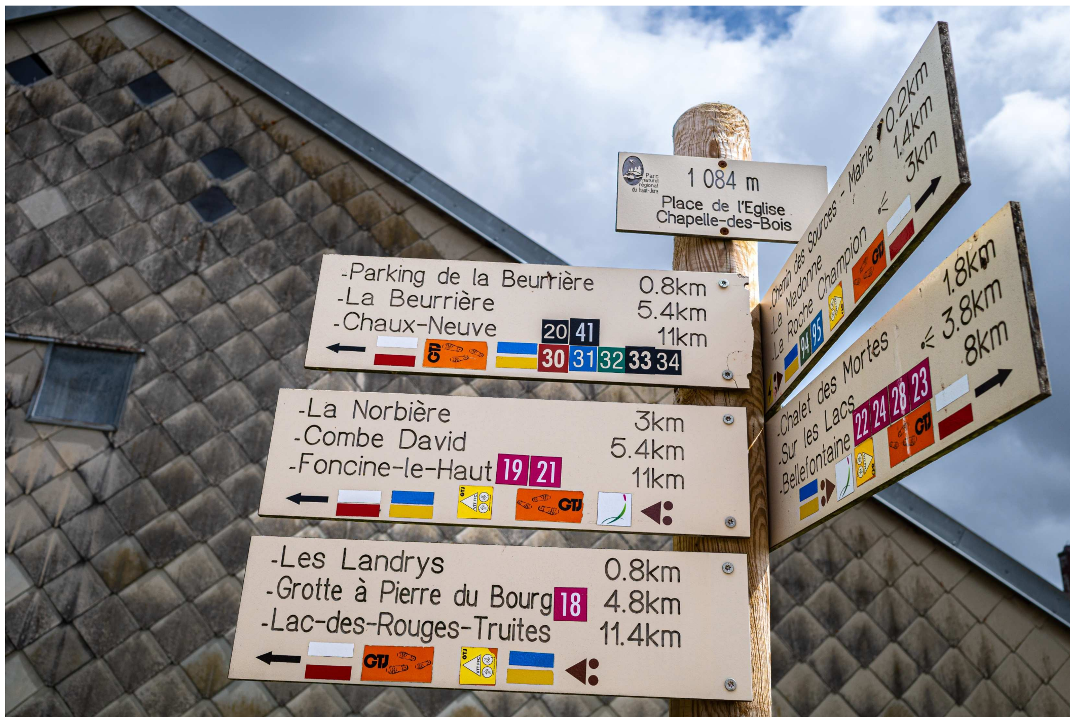
Lots to choose from Chapelle-des-Bois, France