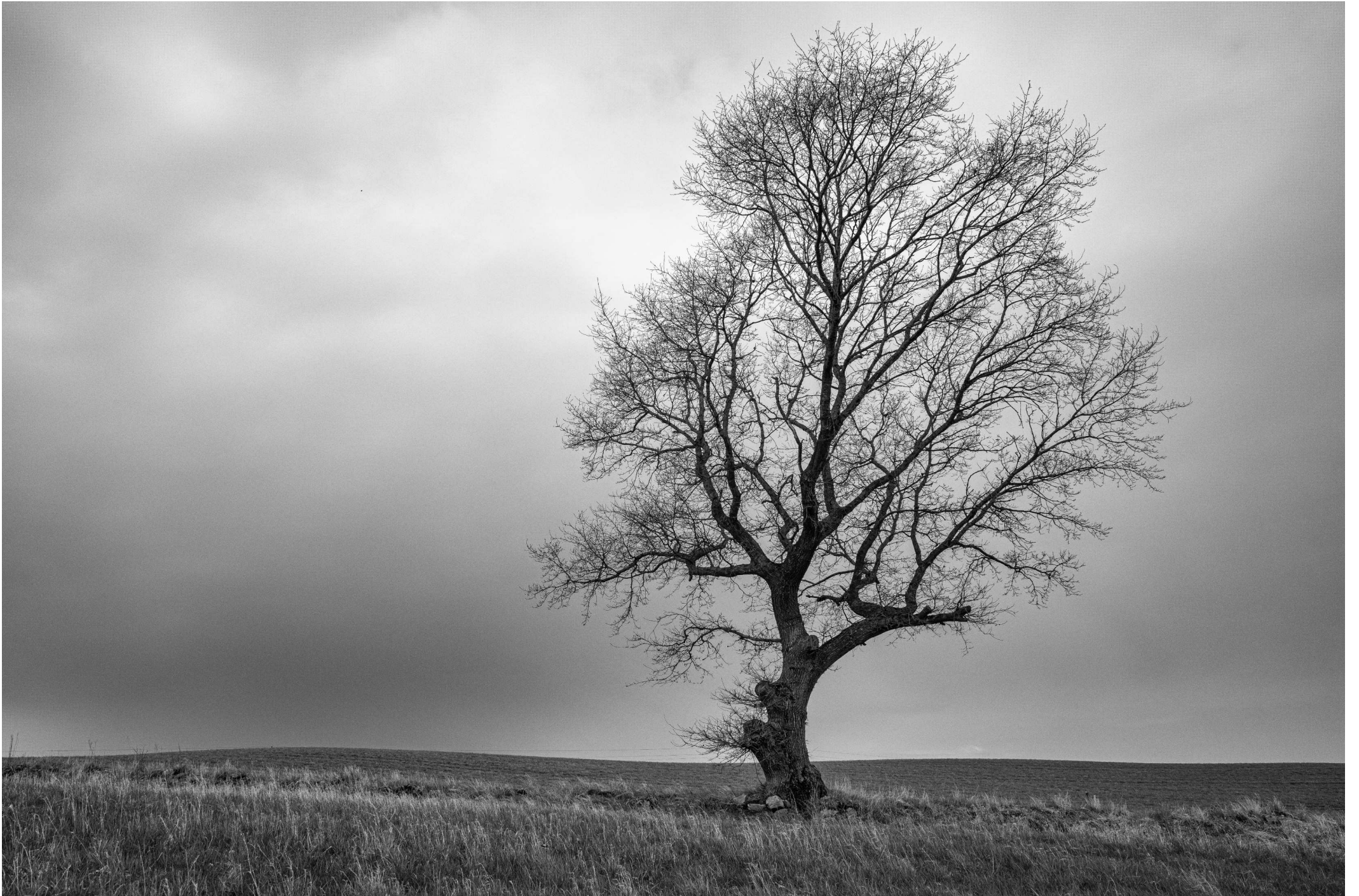
My home district Skåne, Sweden Open landscapes with wild clouds