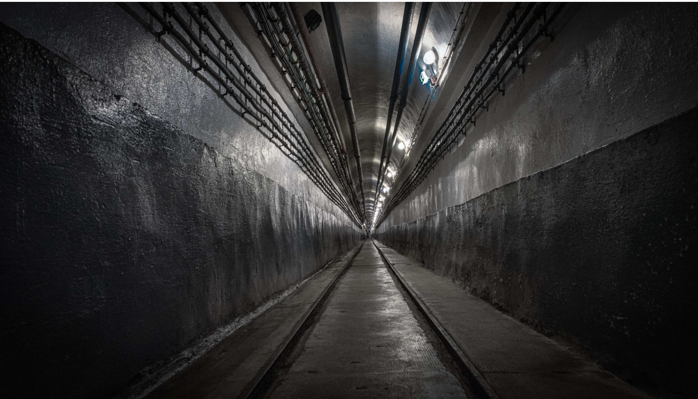
Maginot line of defense Fort Schoenenbourg, France

Next side: The Fort Chapel with place for four believers Fort Schoenenbourg was manned with 600 soldiers