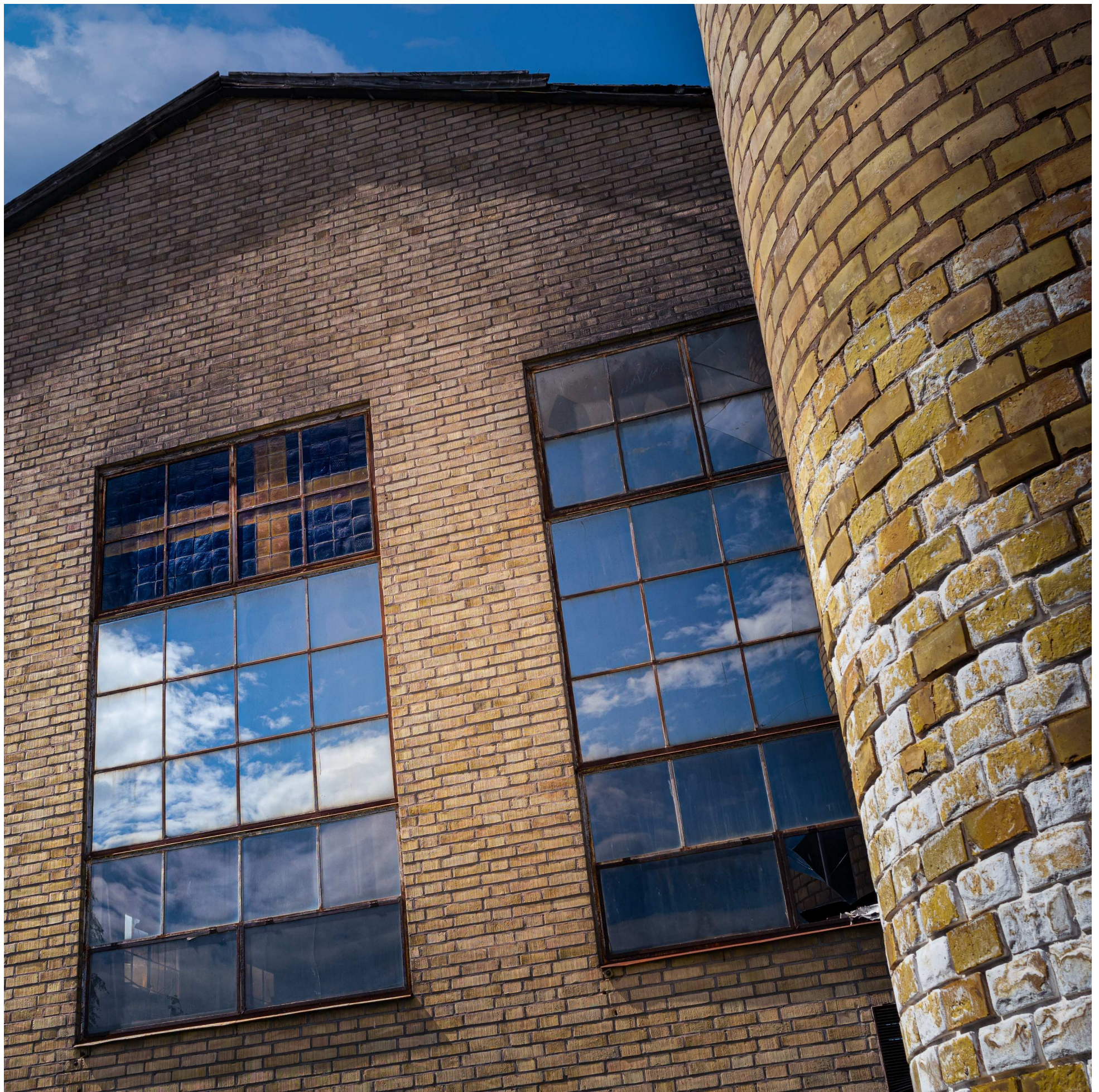
Swedish flag at Lindshammar old glassworks