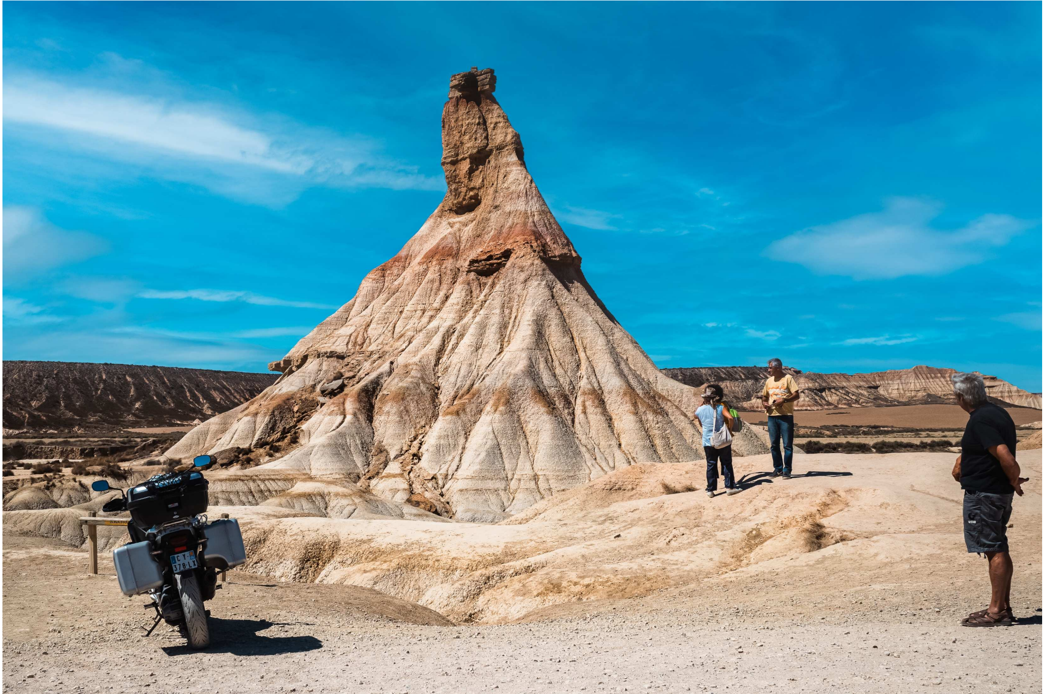
Bardenas Reales, Spain The only desert in Europe