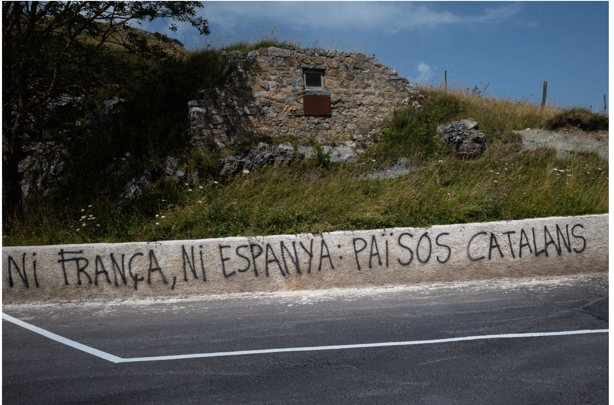
Officially the border between France and Spain. The message on the wall means otherwise