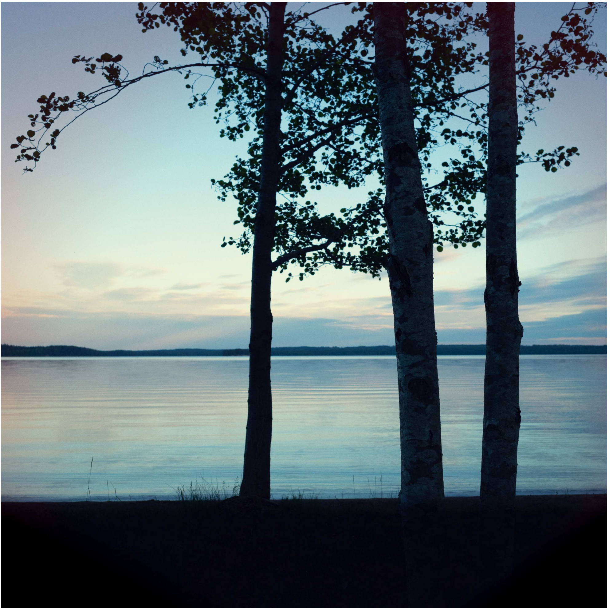
Lake Mycklaflon, Sweden