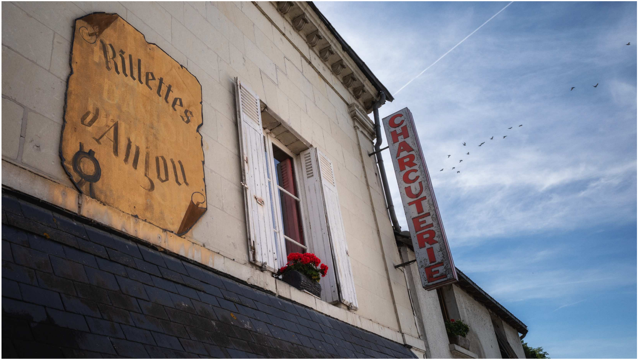
Montsoreau by Loire, France