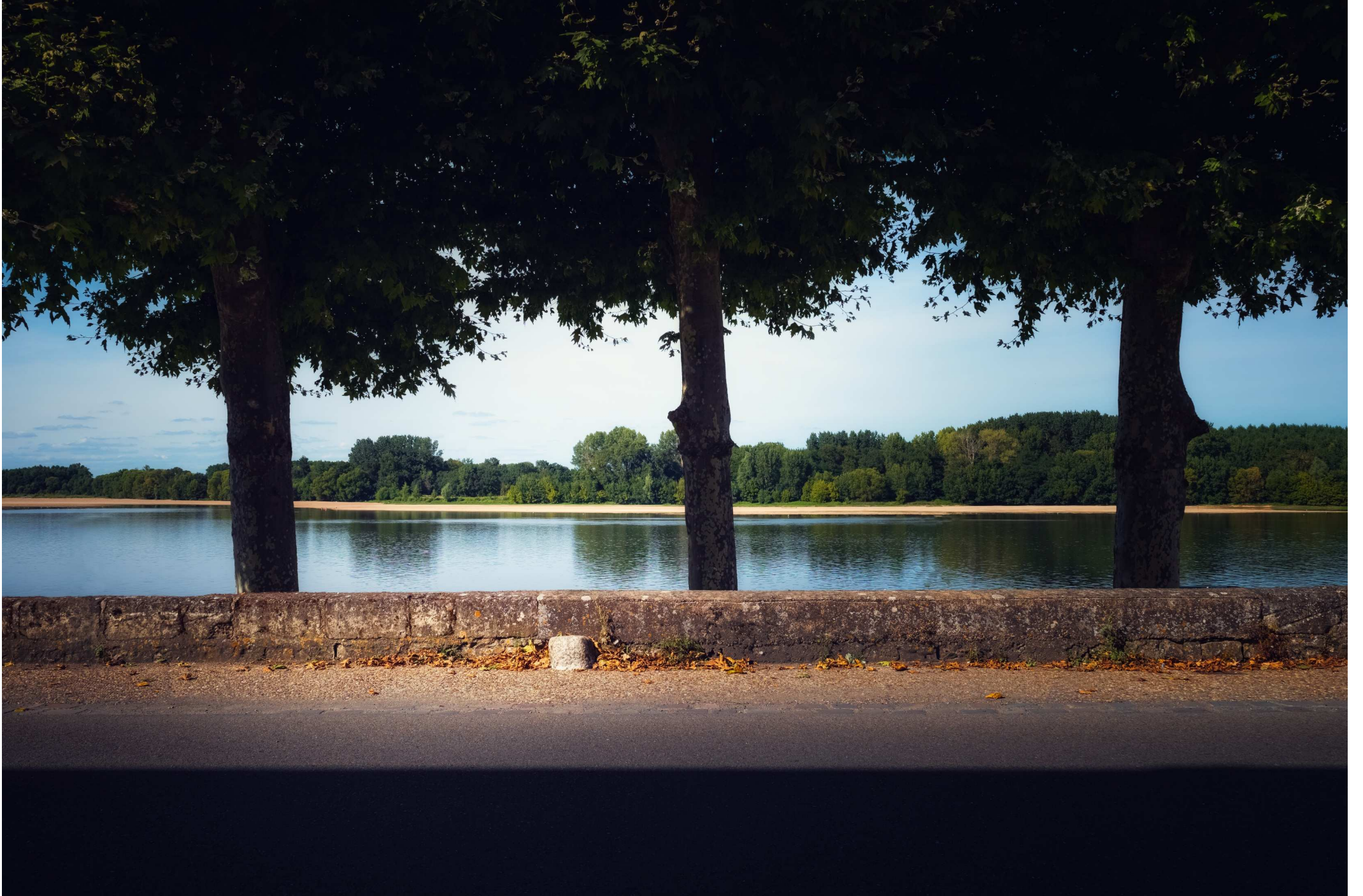
Montsoreau by Loire, France