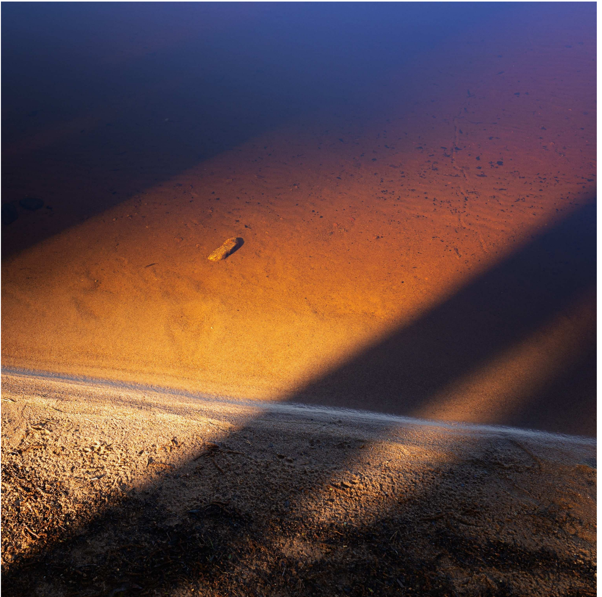
Morning sun at lake, Sweden